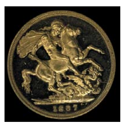
Upon closer examination, the altered surfaces of this 1887 Sovereign are revealed. Note the artificial 'frosting" added on the coin's devices to enhance its cameo appearance but which have spilled over into the fields.

LACQUER is a clear chemical that is sometimes applied to the surface of the coin to protect it. Over time, however, this coating can crack, flake and discolor, giving the coin an undesirable appearance. In the past, countries lacquered coins at the mint before shipping. Therefore, this process can occur at the mint or afterwards.