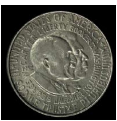
After they leave the Mint, coins can inadvertently be damaged in a number of ways. This is an example of a scratched coin.

WHEEL MARKS occur when a coin counter has left a mark on the coin leaving a highly polished spot.