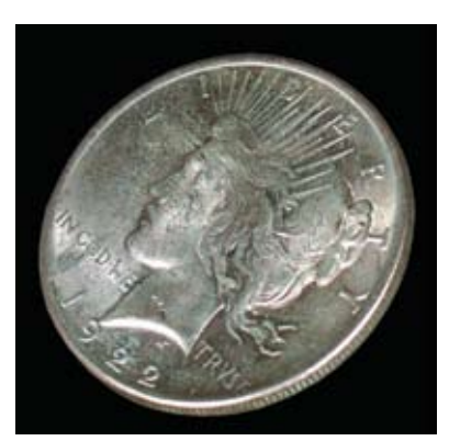
This Peace dollar has a layer of PVC residue that is easily observed. Note the "off" color of light green haze on the coin's surface.

It may be possible to remove PVC from a coin's surface, depending on the depth of the PVC film, and the length of time it has been on the coin. Only an experienced professional should perform this work. Improper PVC removal can result in a No Grade designation of PVC DAMAGE or CLEANED .