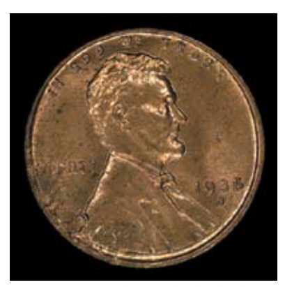
As a general rule, NGC will not certify coins with minor flaws such as rim clips or, in this case, lamination.

NGC will also not grade coins that have a small part of the design missing, resulting in an ILLEGIBLE DATE or ILLEGIBLE MINTMARK . Such missing details are typically due to the dies being excessively worn or filled with grease. Major missing details due to filled dies that affect a large portion of the coin are graded under NGC's regular tiers as "Mint Error" coins.