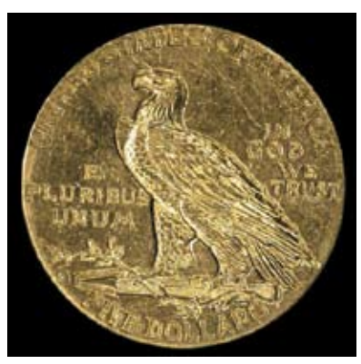
This struck counterfeit 1916 S $5 gold piece is identified as not genuine by its "S" mint mark, seen below, which is the wrong shape and in the wrong position.

An otherwise genuine coin may show an ALTERED DATE to increase its apparent value. A coin may bear an ADDED MINTMARK when that mint's coins are at a premium. If the Philadelphia Mint issue is worth more than its branch mint counterparts, the coin may have a REMOVED MINTMARK .