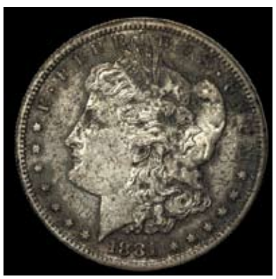
Corrosion, as shown on this Morgan dollar, will result in a No Grade designation.

A STAINED coin is one that displays a discoloration as the result of some form of environmental damage.