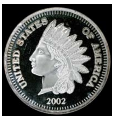
Coins such as this Silver Round are not eligible for NGC certification.

To be certain that your coins, tokens, and medals are eligible, check the NGC Service Guide or the NGC Web site at www.NGCcoin.com for a current list of eligible types and dates before submitting.