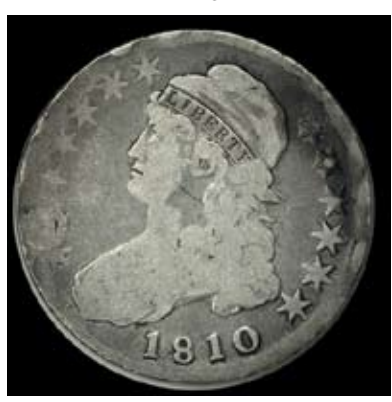
This Bust type silver half dollar from 1810 has been plugged.

TOOLING refers to either the smoothing of a coin's fields to remove scratches, corrosion, and other forms of damage or the restoration of lost details through use of a graver or knife. RE-ENGRAVED coins are done in a similar fashion. However, the purpose is to strengthen lost detail through mechanical means.