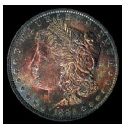
Artificial toning can be extremely difficult to detect, and even harder to explain once discovered. Perhaps the best explanation is that it just does not appear natural.

A coin that has been immersed in a diluted acid solution (or, commonly referred to as "dipped") and not properly rinsed will probably develop traces of DIP RESIDUE . This gives the coin a cloudy or unnatural brown look. If this staining is severe, the coin will not be graded.