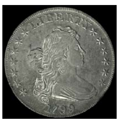
Improper Spot Removal can result in damage to a coin, such as the scratch marks seen in the close-up, below, of this 1799 dollar.

A WIPED coin is one that has been rubbed with a dry cloth or other abrasive material, leaving fine "hairline" scratches on its surfaces. A BRUSHED coin will display similar, but much heavier, abrasive lines.